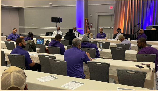
Preaching in Portland - Men's Mental Health Panel Discussion

From May 14th to 18th, I was blessed to preach the Gospel and participate in a transformative Men's Mental Health Conference in Portland, Oregon. It was truly uplifting to join with partnering churches, ministers, and their choirs in heartfelt worship of Jesus Christ and to witness men coming together, seeking God's guidance for their lives and families. The unity and hunger for God's presence were inspiring reminders of the hope and healing found in Christ. Later that week, I had the honor of sharing alongside dedicated counselors and coaches who serve men facing mental health challenges. With suicide now the second or third leading cause of death among young men ages 15-34, our sons, brothers, uncles, and fathers need our prayers, support, and encouragement more than ever. But we are not without hope—Christ Jesus, our living Hope, walks with us and empowers us to lift one another up. Together, as a community of faith, we can bring light, compassion, and strength to those who need it most.